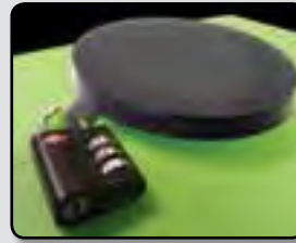
Locking cap (Lock is not included)