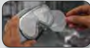
Peel-Off Lens Covers Available